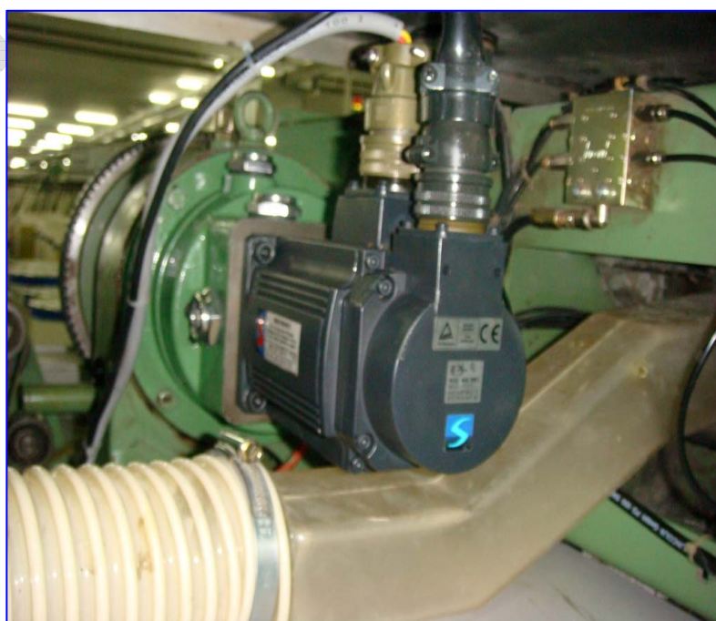
SERVO MOTOR ASSEMBLY MOUNTED ON THE MACHINE