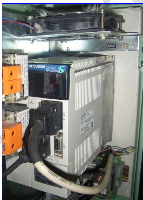
SERVO AMPLIFIER ASSEMBLY MOUNTED ON THE PANEL VIEW